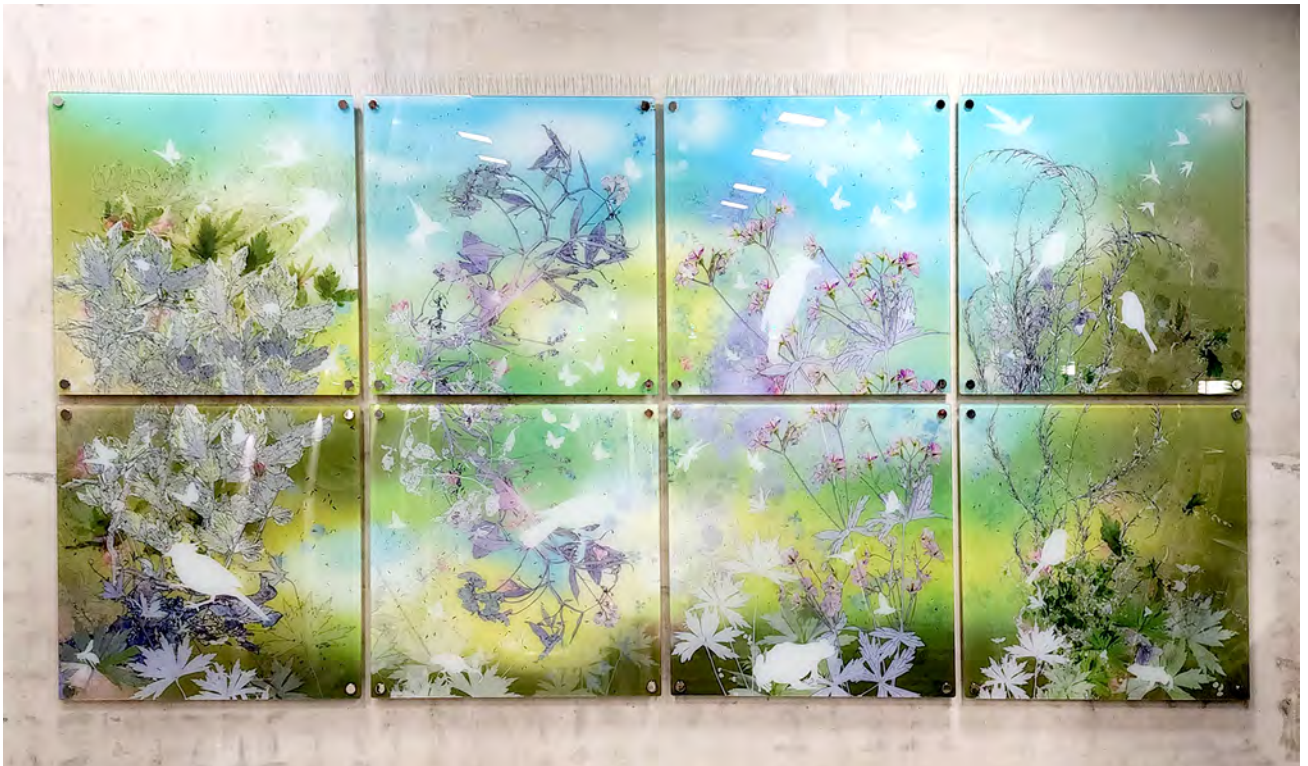
All eight (8) 60" x 60" printed, laminated glass panels in-situ at TTC Donlands station in Toronto