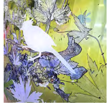
Artwork printed on laminated glass

Highlights - The artwork "Field", an image comprised of flora, flowers, indigenous plants, birds and insects was printed in house on eight (8) 60" x 60" laminated tempered glass panels, each weighing approximately 240 lbs. These panels feature four mounting points, secured to the existing concrete wall using stainless steel threaded rods with a minimum embedment depth of 2.375 inches. The polished stainless steel stand-off bases and caps are attached to the threaded rods and create a level surface between the glass panels.