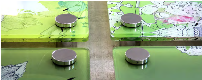
Detail of polished stainless steel caps and stand off bases that secure the panels to the concrete wall.