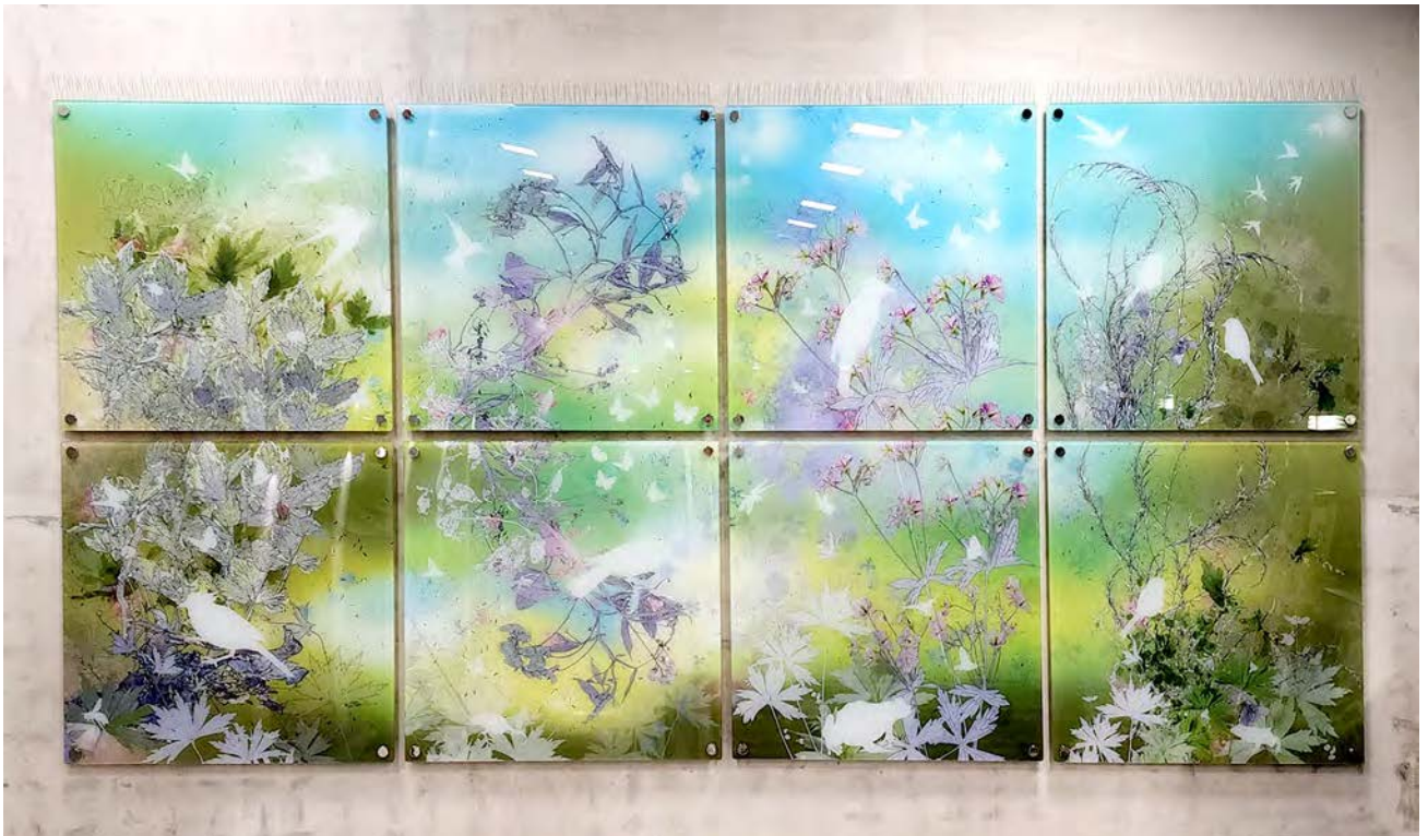
All eight (8) 60" x 60" printed, laminated glass panels in-situ at TTC Donlands station in Toronto