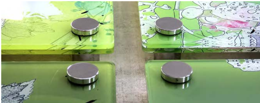
Detail of polished stainless steel caps and stand off bases that secure the panels to the concrete wall.