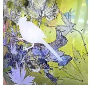
Artwork printed on laminated glass

Highlights - The artwork "Field", an image comprised of flora, flowers, indigenous plants, birds and insects was printed in house on eight (8) 60" x 60" laminated tempered glass panels, each weighing approximately 240 lbs. These panels feature four mounting points, secured to the existing concrete wall using stainless steel threaded rods with a minimum embedment depth of 2.375 inches. The polished stainless steel stand-off bases and caps are attached to the threaded rods and create a level surface between the glass panels.