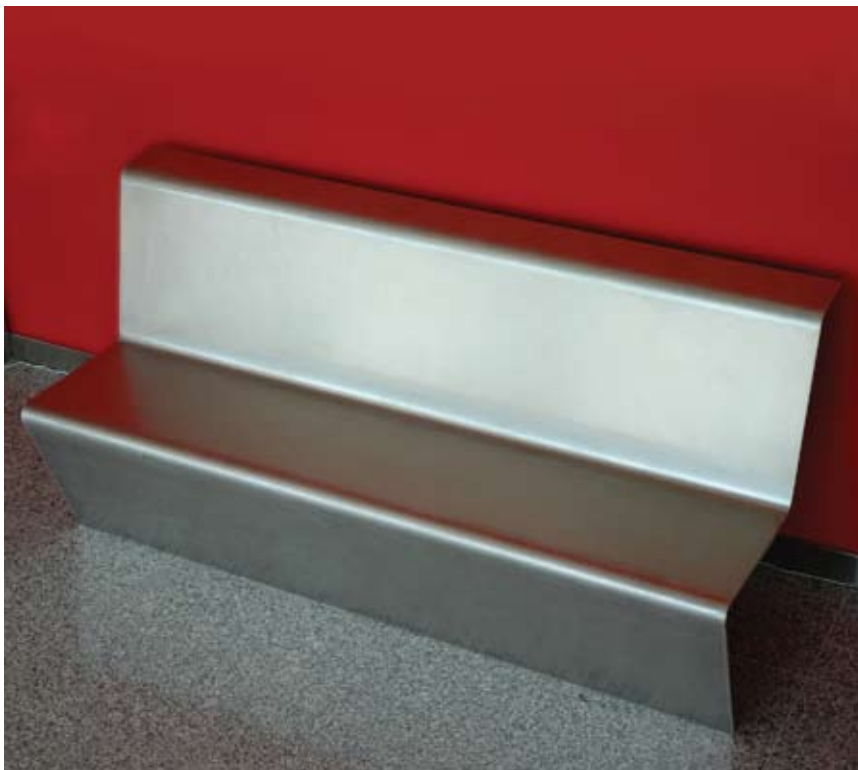
Sleek elegant one-piece design