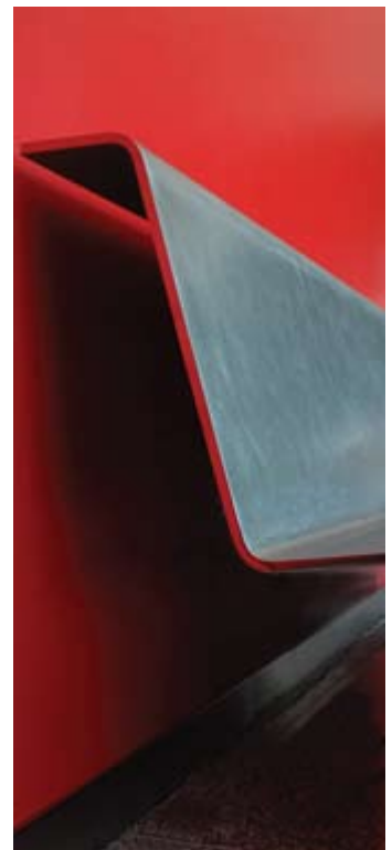
Mirror polished edges