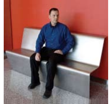
Optional lengths depending on requirements

Highlights - Formed from one sheet of 1/2" thick stainless steel with four bends (three of which are visible) the bench is bolted to the concrete slab with granite floor tiles hiding the fasteners. Edges are mirror polished, and all other surfaces have SML's non-directional orbital finish applied, an ideal treatment for high traffic applications such as this. This finish can be touched up easily in the event of vandalism or minor scratches that build up over time. Dimensions of this bench are approximately 6'-6" in length, 3' in height and 2'-6" deep. Length of the bench can vary to suit site/design requirements. Alloy 316 stainless steel recommended for exterior applications and as an option, a heating element can be built into the bench.