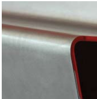
SML's special non-directional orbital finish