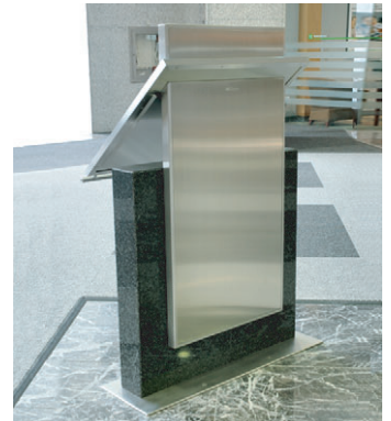
Back of directory featuring brushed st. stl. cladding

Highlights - Directories utilize a welded steel sub-frames, with Nero Impala black granite cladding at the bottoms, stainless steel cladding at the tops, and cantilevered clear glass faces protecting full-color printed maps and tenant information.