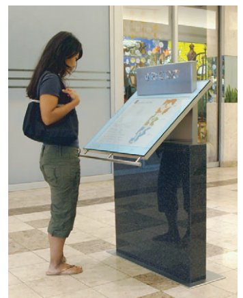
Customer using wayfinding directory