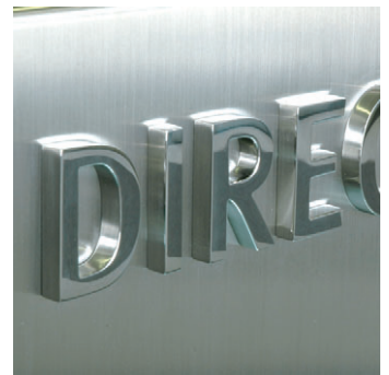
Polished st. stl. lettering on brushed st. stl. cladding