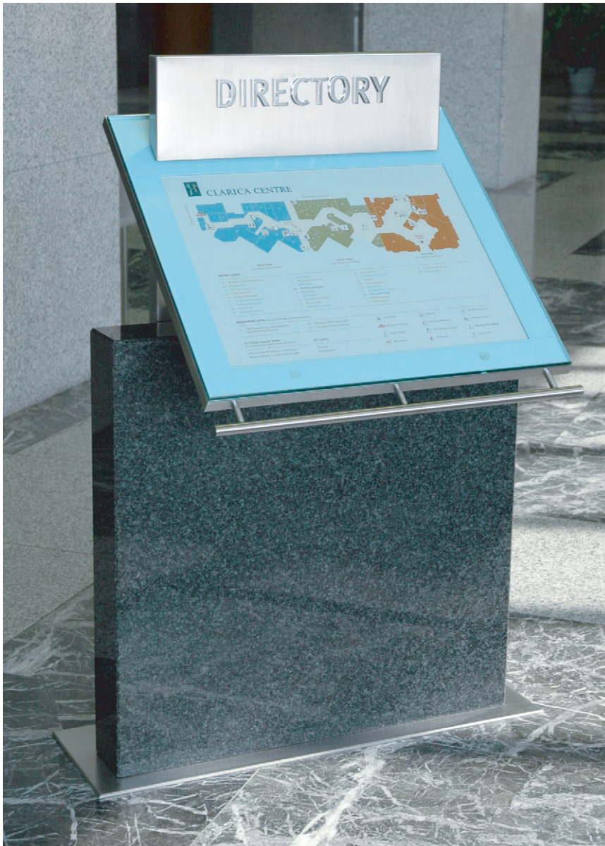
Freestanding directory with st. stl. and Nero Impala black granite cladding as well as cantilevered clear glass face