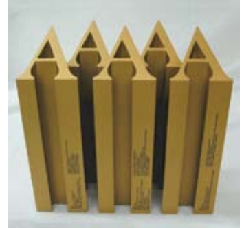
A group of awards

Highlights - The award (better known as the 'A-Award') is made of extruded aluminum and is finished with an attractive matte metallic acrylic polyurethane paint. When cut on a specific angle, the extrusion yields a perfectly rendered Times New Roman 'A'. The club's name is engraved, while the recipient's name is screen printed in black.