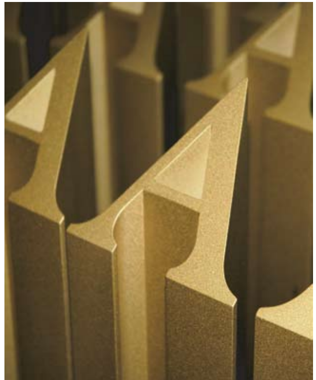
Matte metallic finish