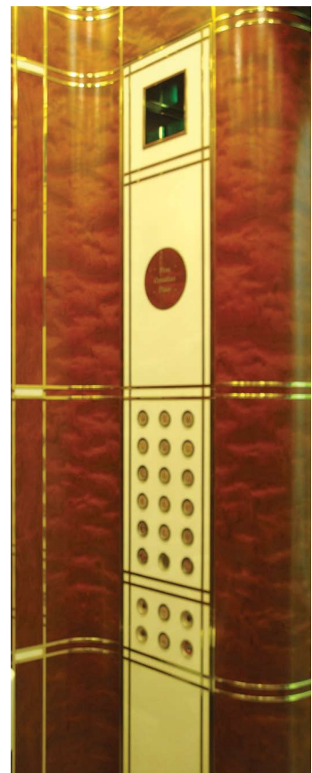
Marble Operating Panel with Brass Inlays