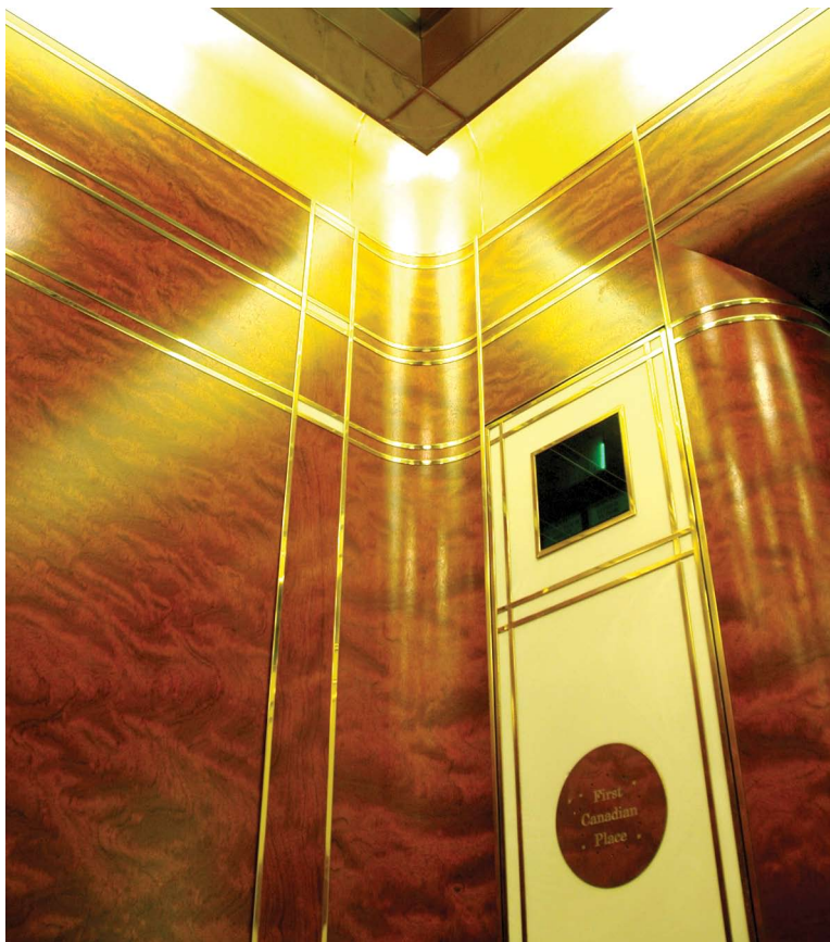
Bubinga Wood Veneer with Polished Brass and Marble Inlays