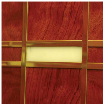
Detail of the Marble and Brass Inlays

Highlights - Drop ceiling fabricated in two types of marble completed with polished brass inlays, back-lit with compact fluorescent lighting as well as recessed down lighting. Rear and side walls fabricated with "Bubinga" veneered wood paneling with polished brass inlays. Flooring made from custom water-jet cut shaped marble tiles completed with polished brass inlays. Doors clad in polished brass metal.