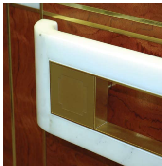
Detail of the White Marble Hand Rails