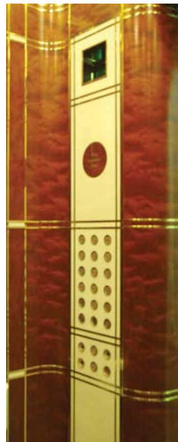
Marble Operating Panel with Brass Inlays