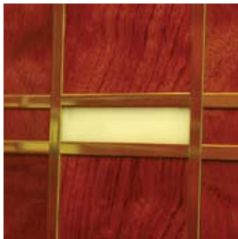
Detail of the Marble and Brass Inlays

Highlights - Drop ceiling fabricated in two types of marble completed with polished brass inlays, back-lit with compact fluorescent lighting as well as recessed down lighting. Rear and side walls fabricated with "Bubinga" veneered wood paneling with polished brass inlays. Flooring made from custom water-jet cut shaped marble tiles completed with polished brass inlays. Doors clad in polished brass metal.