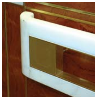
Detail of the White Marble Hand Rails