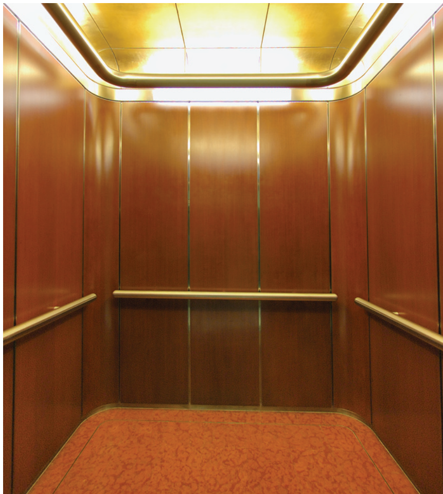
Full View of the Cab Interior.