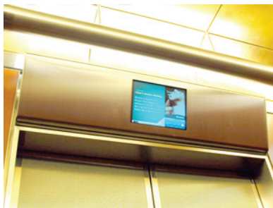
Custom Built Display Housing

Highlights - Features include aluminum ceilings enhanced with 23 carat gold leaf, anigre veneer panels, stainless steel handrails, stainless steel reveals, compact fluorescent energy efficient up-lighting, wire mesh stainless steel doors, segmented digital position indicator and custom built stainless steel display housing.